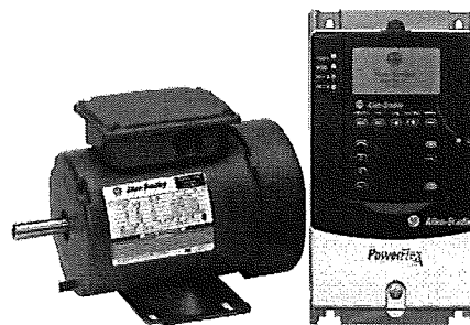
Bulletin 1329R motors are Control-Matched™ for use with PowerFlex™ 70 variable-speed drives.